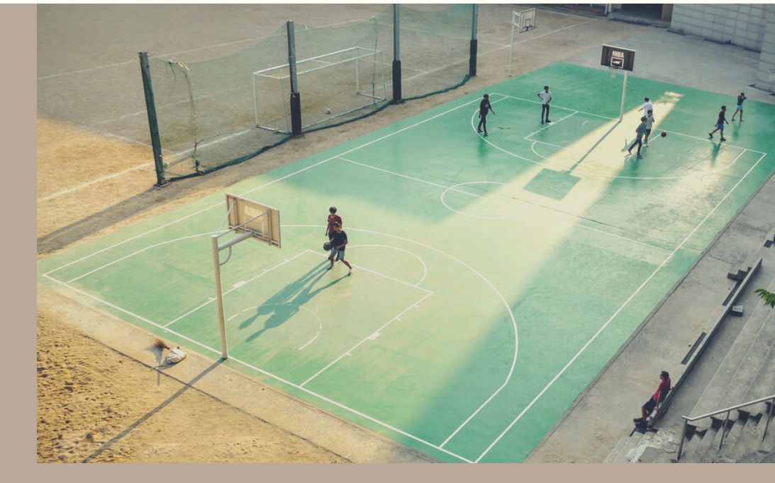
All proceeds of this fundrasier will be used to support the mission and projects Hearts of Empowerment has planned for 2021