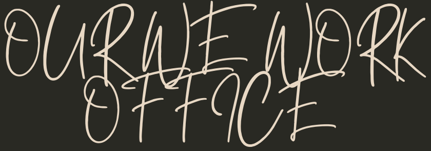
Welcome to the Hearts of Empowerment HQ!

Earlier this year, the Hearts of Empowerment team celebrated the accomplishment of purchasing an office space to call home! We couldn't be more excited. This office space has given us the opportunity to strategize, learn and network in order to propel our mission forward.